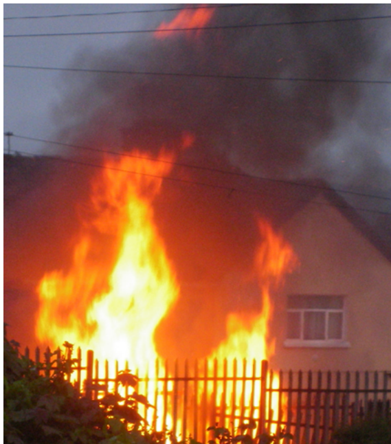
Above: 30 April 2007, Bonfire Night – Burning rubbish in Clarina Ave. For a while it seemed that Bonfire Night was a weekly event. As well as the health risk, such fires have damaged phone lines.