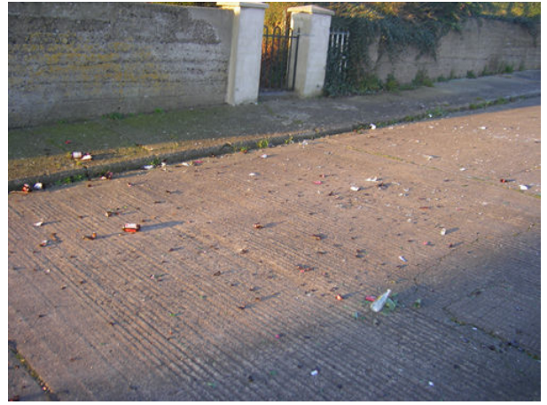
Above: Our Avenue littered with broken bottles thrown by youths from Clarina Avenue. This used to be a regular occurrence, especially at weekends. Such incidents are less frequent now, the last one being March 2007.