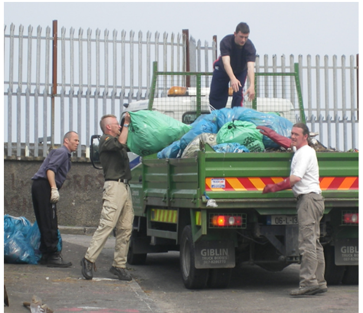
Above: 30 April 2007 Residents clean up. The WGRA registered with An Taisce's National Spring Clean to clean up the gardens of No.'s 1, 2 & 3. We needed permission from LCC's Housing Dept., which wasn't given. We went ahead regardless, removing 8½ tons.