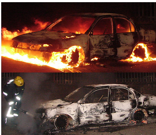
Above: October 2007, the Fire Brigade extinguishes a burning stolen car. This incident left Weston Gardens inaccessible for several hours. This problem is ongoing. Often, driveways have been blocked and property damaged.