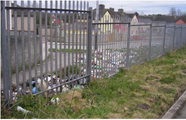
Above: The two sides of the 'green'. We do our best to keep Weston Gardens tidy. The illegal dumping is being done by a handful of residents in Ballinacurra Weston. The resultant rat infestation and health risks posed to residents are major concerns.