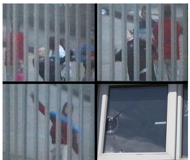
Above: May 2005, children and teenagers, under adult supervision, throw stones at our homes from Clarina Avenue. Our residents have witnessed adults actually directing children; instructing them which house to target.